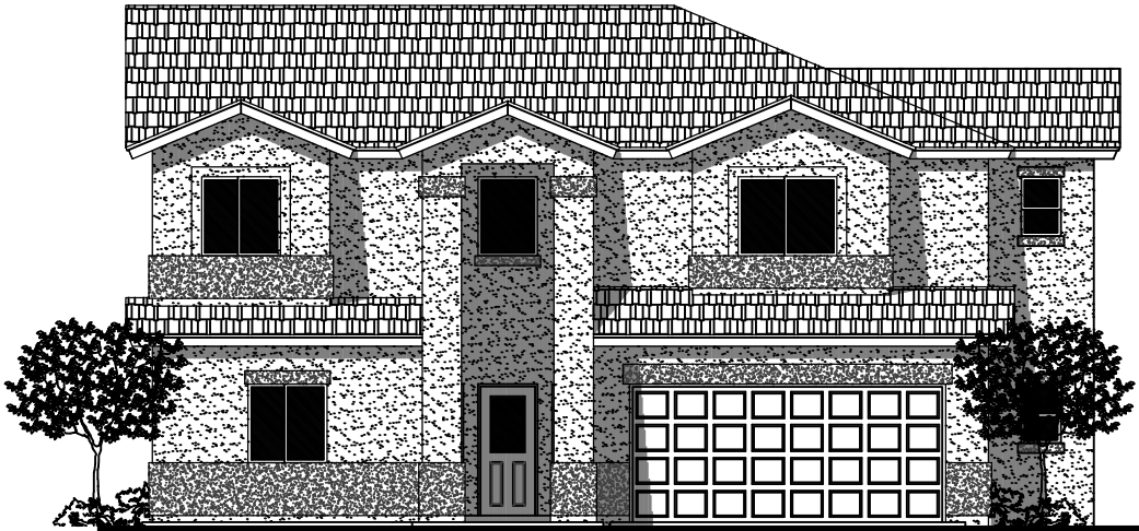
S - ELEVATION