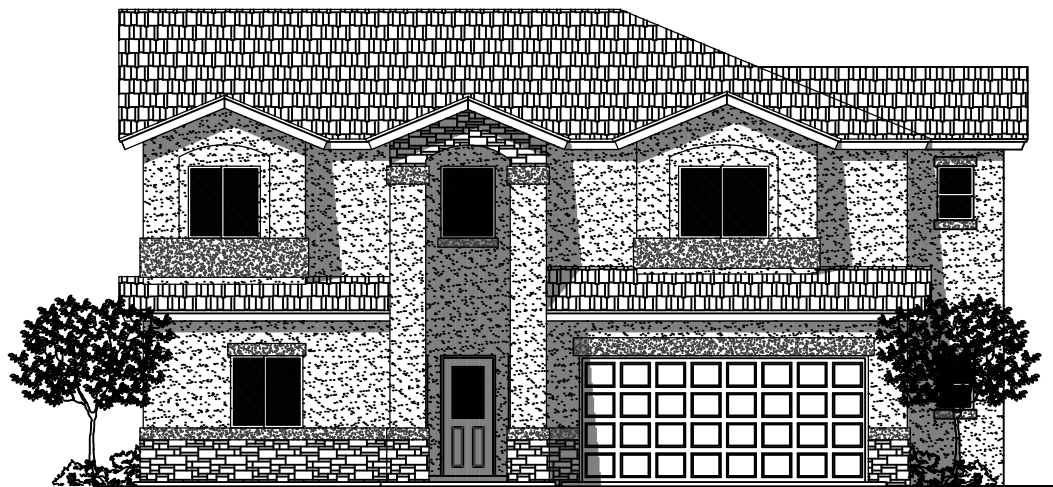
C - ELEVATION (CULTURED STONE)