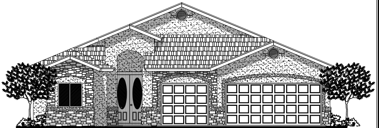
C - ELEVATION (CULTURED STONE)