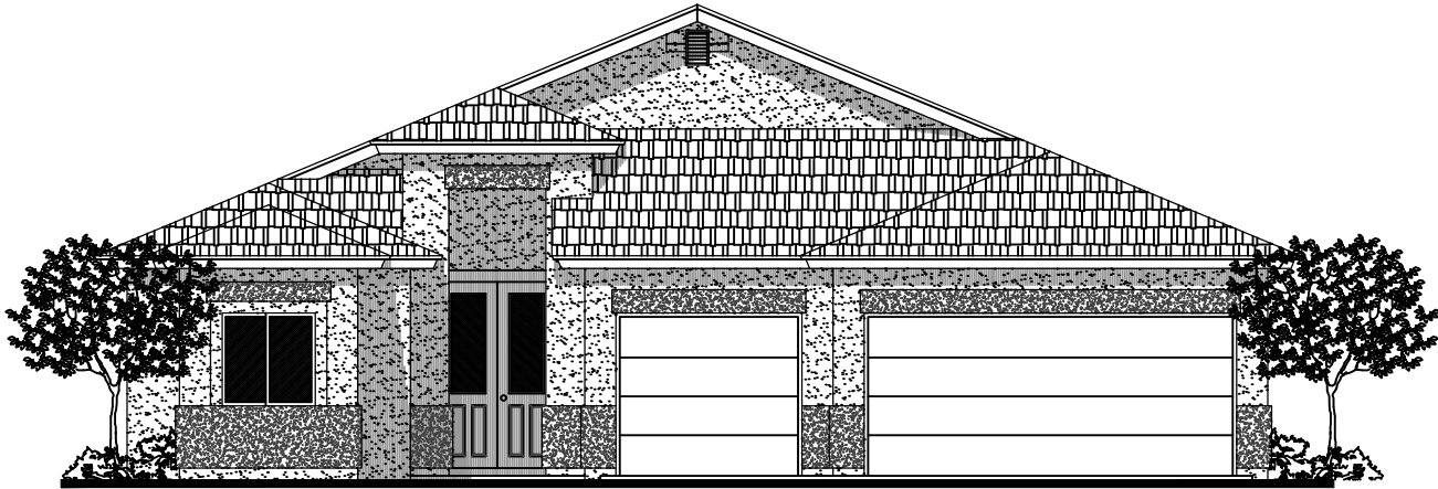
S - ELEVATION (STUCCO)