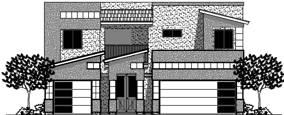
Y - ELEVATION (CONTEMPORARY)