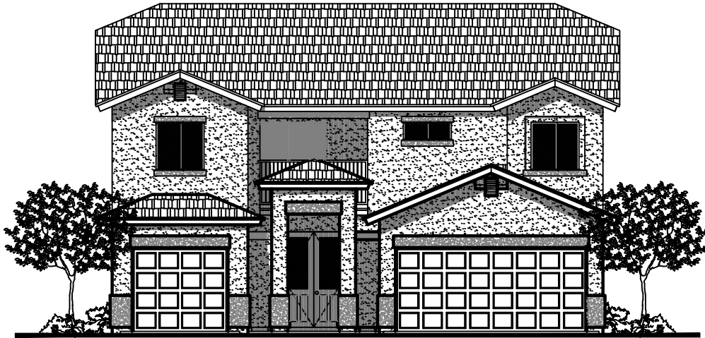
S - ELEVATION