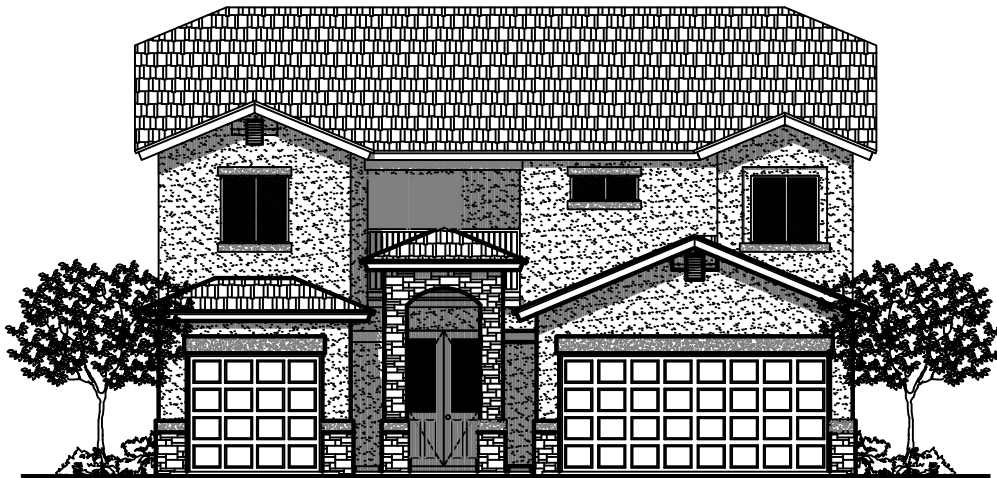
C - ELEVATION (CULTURED STONE)